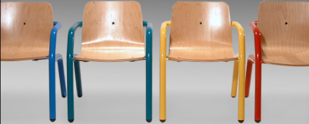
1503C1 with birch shells