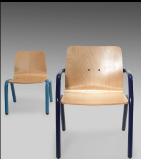
1503C2 and 1502C1 in background